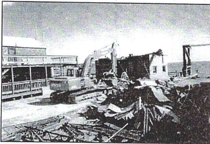
The old tin shed is removed on March 17.